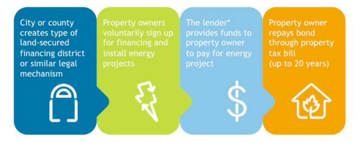
Depending upon program the structure, the lender may be a private capital provider or the local jurisdiction*

A PACE assessment is a debt of property , meaning the debt is tied to the property as opposed to the property owner(s), so the repayment obligation may transfers with property ownership depending upon state legislation. This eliminates a key disincentive to investing in energy improvements, since many property owners are hesitant to make property improvements if they think they may not stay in the property long enough for the resulting savings to cover the upfront costs.